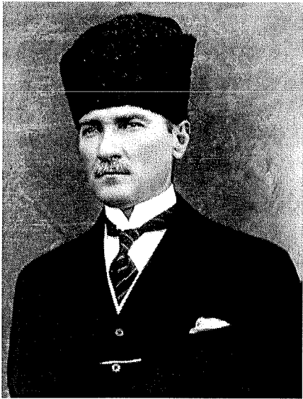
Mustafa Kemal "Ataturk" (1923)